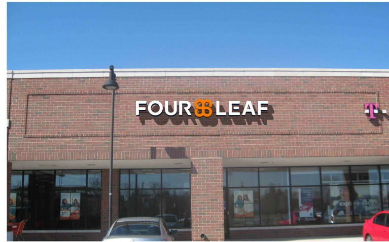
PROPOSED OVERLAY - SCALE BASED OFF OF EXISTING 16'-6" WIDE CHANNEL LETTERS