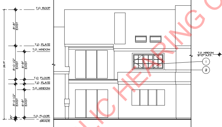
REAR ELEVATION SCALE: 1/4"=1'-0"

The posted plan is subject to change. Please note that this site plan may be modified during the Town Planning Board and/or Town Board review process. Please contact the assigned planning department staff member if you have questions regarding the date and status of any posted graphics.