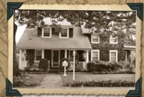
America's Cup Way (circa.1881) Islip Hamlet