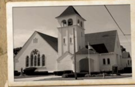
First Congregational Church (circa.1891) Bay Shore