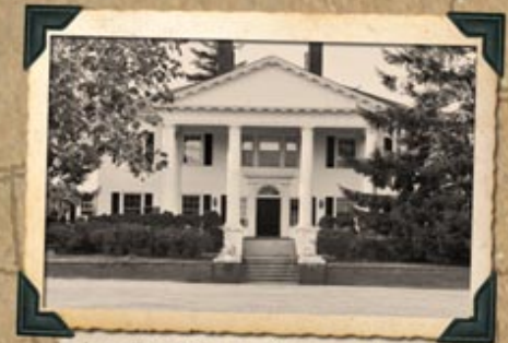
Arnold Manor (circa.1906) West Islip

For More Detailed Information about these Historic Sites Visit the Town of Islip Website at islipny.gov