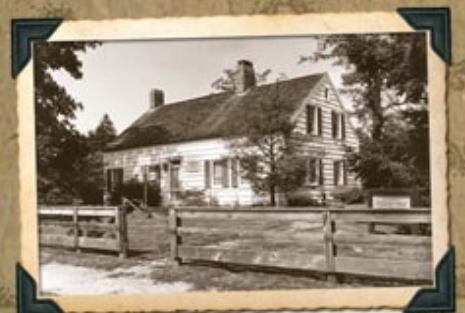
Edwards Homestead (circa.1785) Sayville