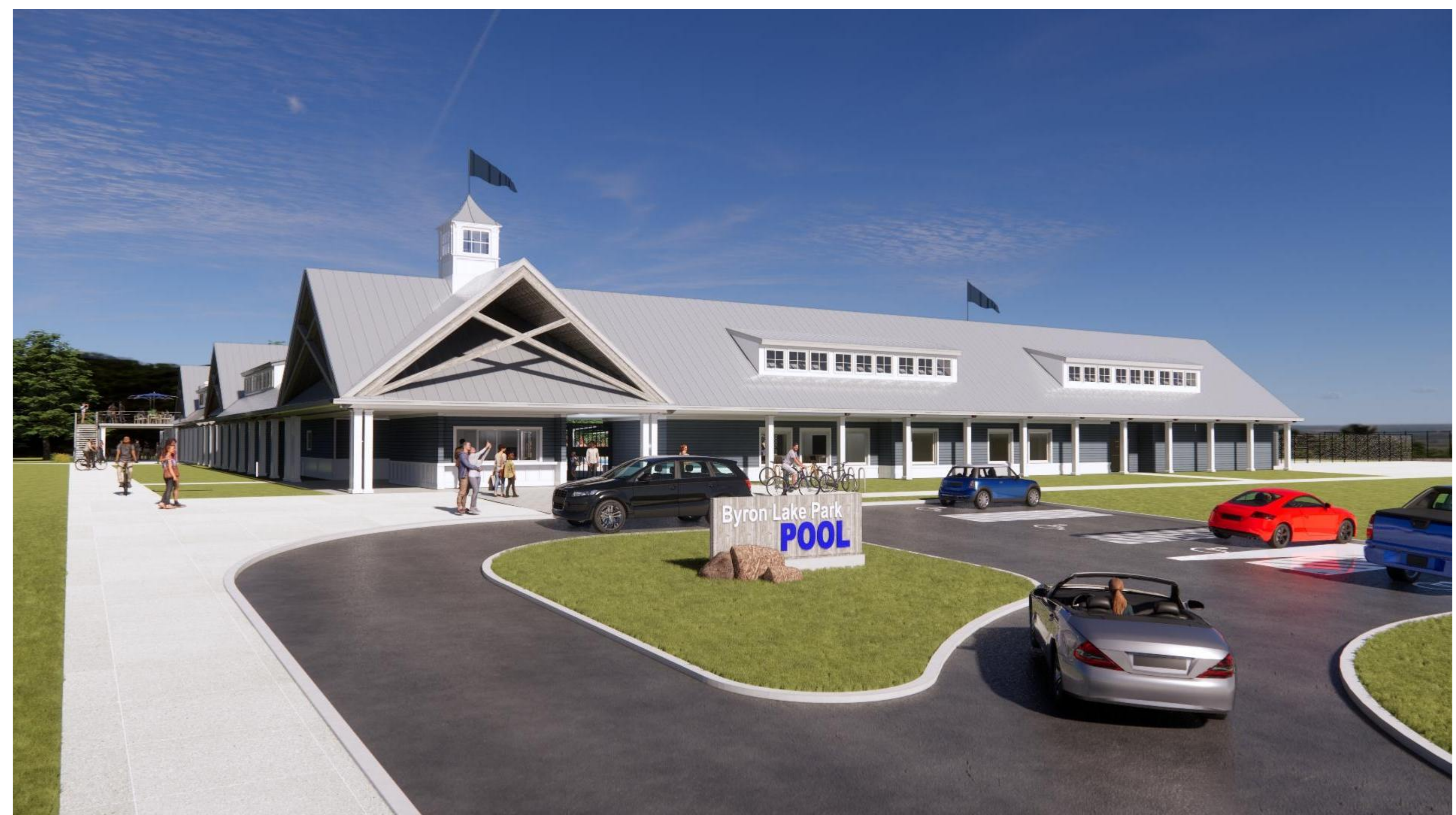
VIEW OF BYRON LAKE POOL ENTRANCE