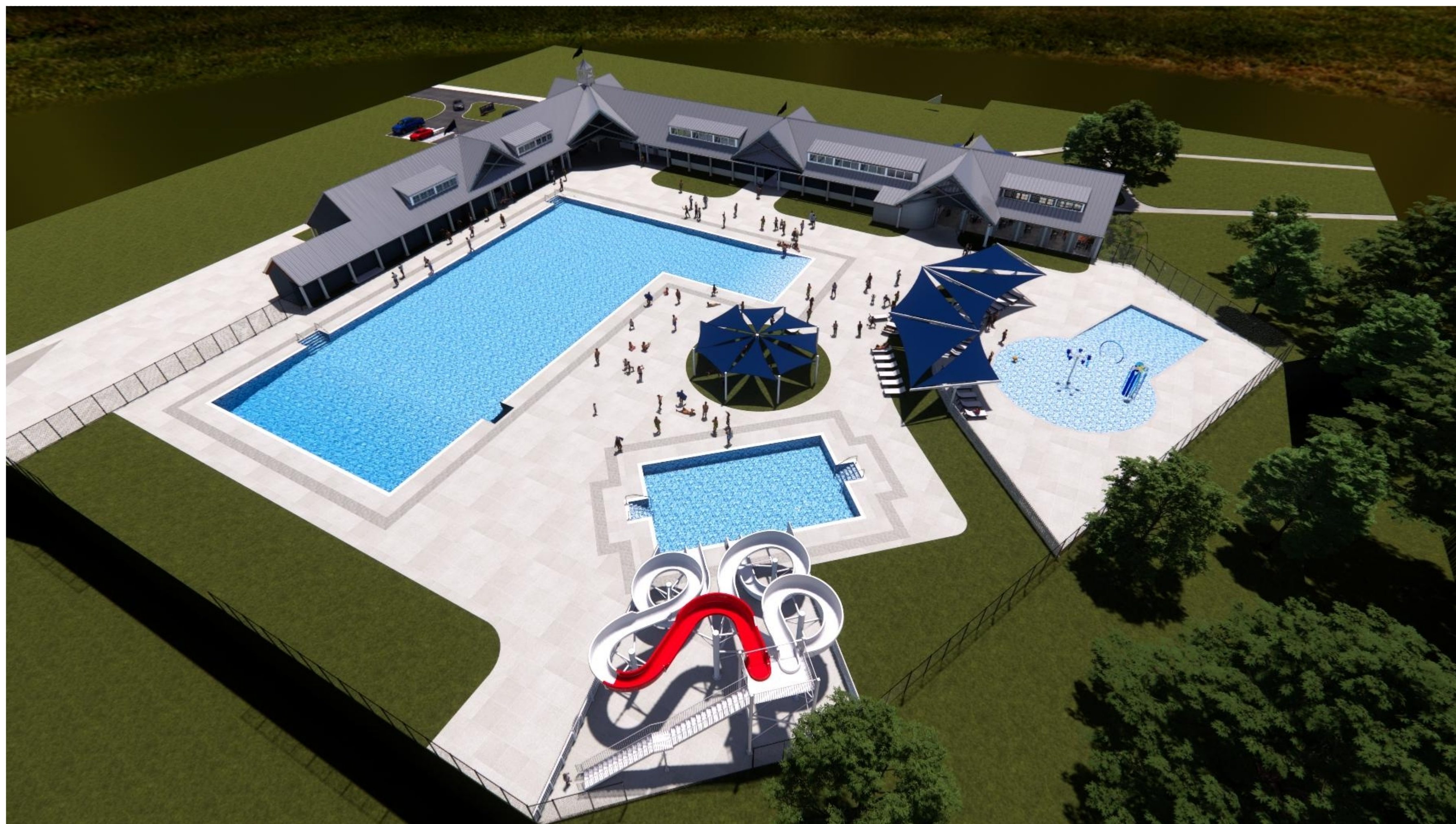
AERIAL VIEW OF BYRON LAKE POOL LOOKING SOUTH EAST