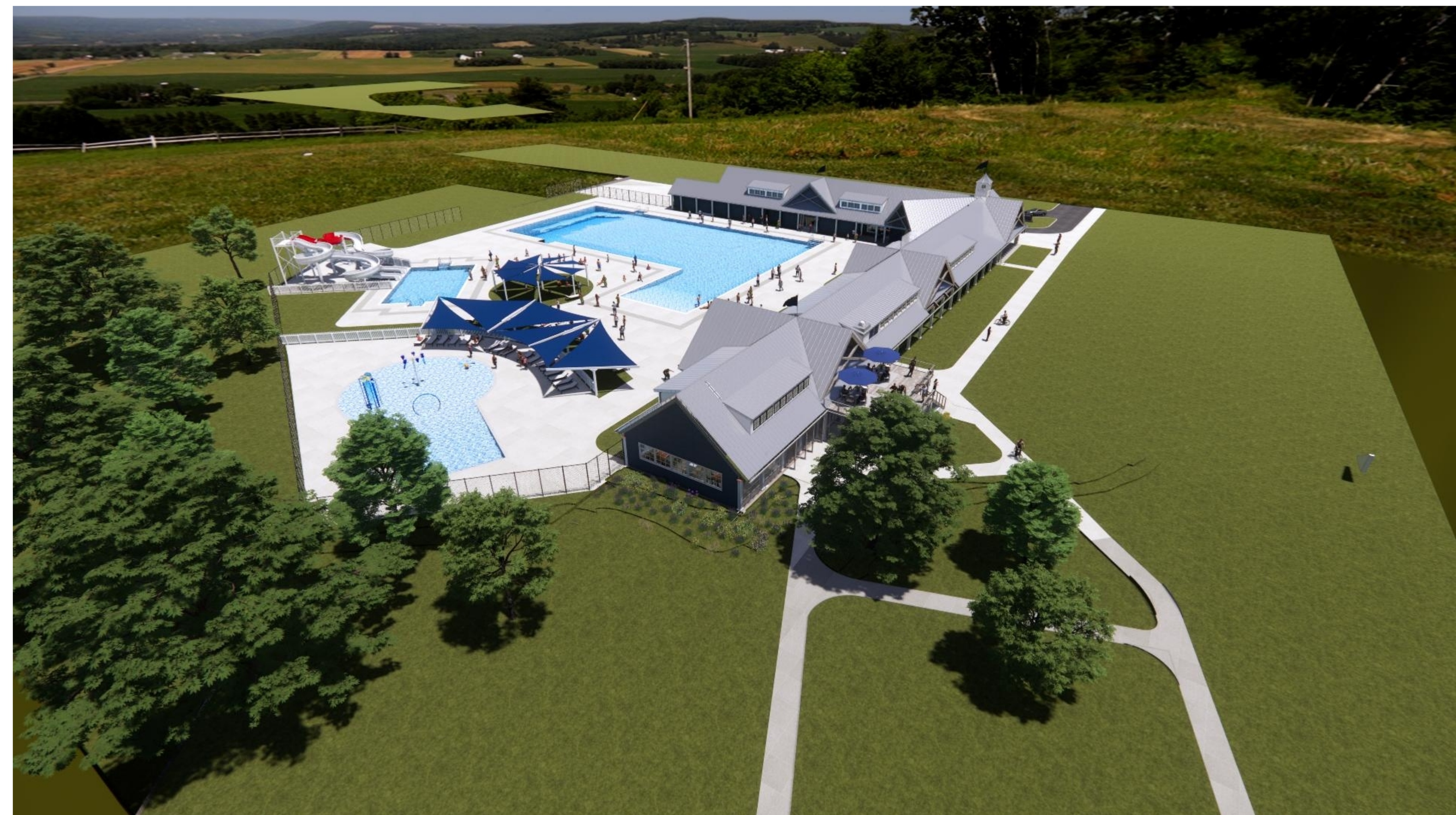
AERIAL VIEW OF BYRON LAKE POOL LOOKING NORTH EAST