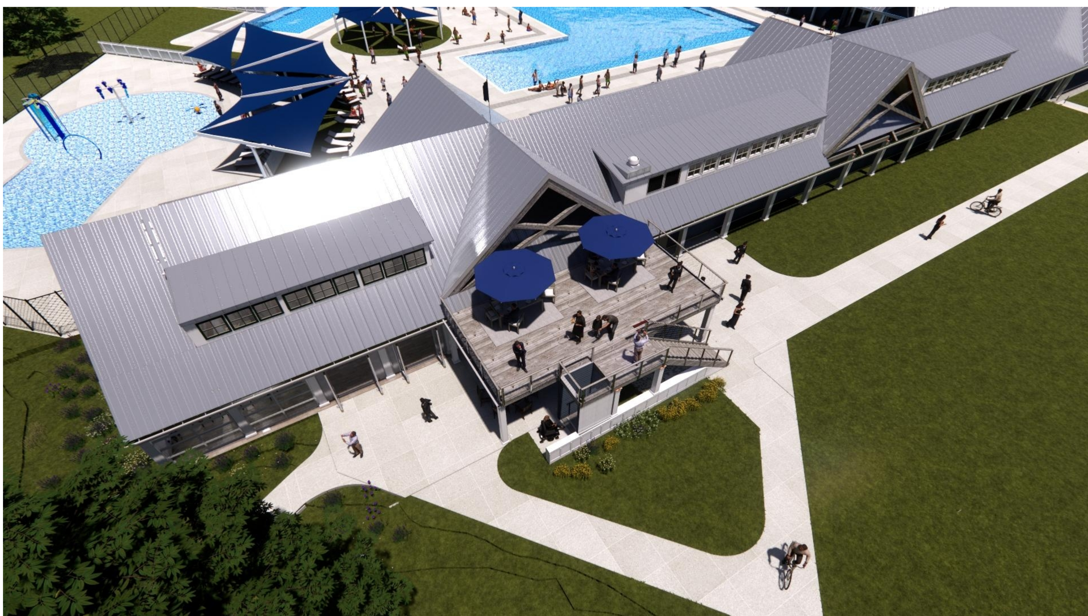
AERIAL VIEW OF BYRON LAKE PARK DECK LOOKING NORTH EAST