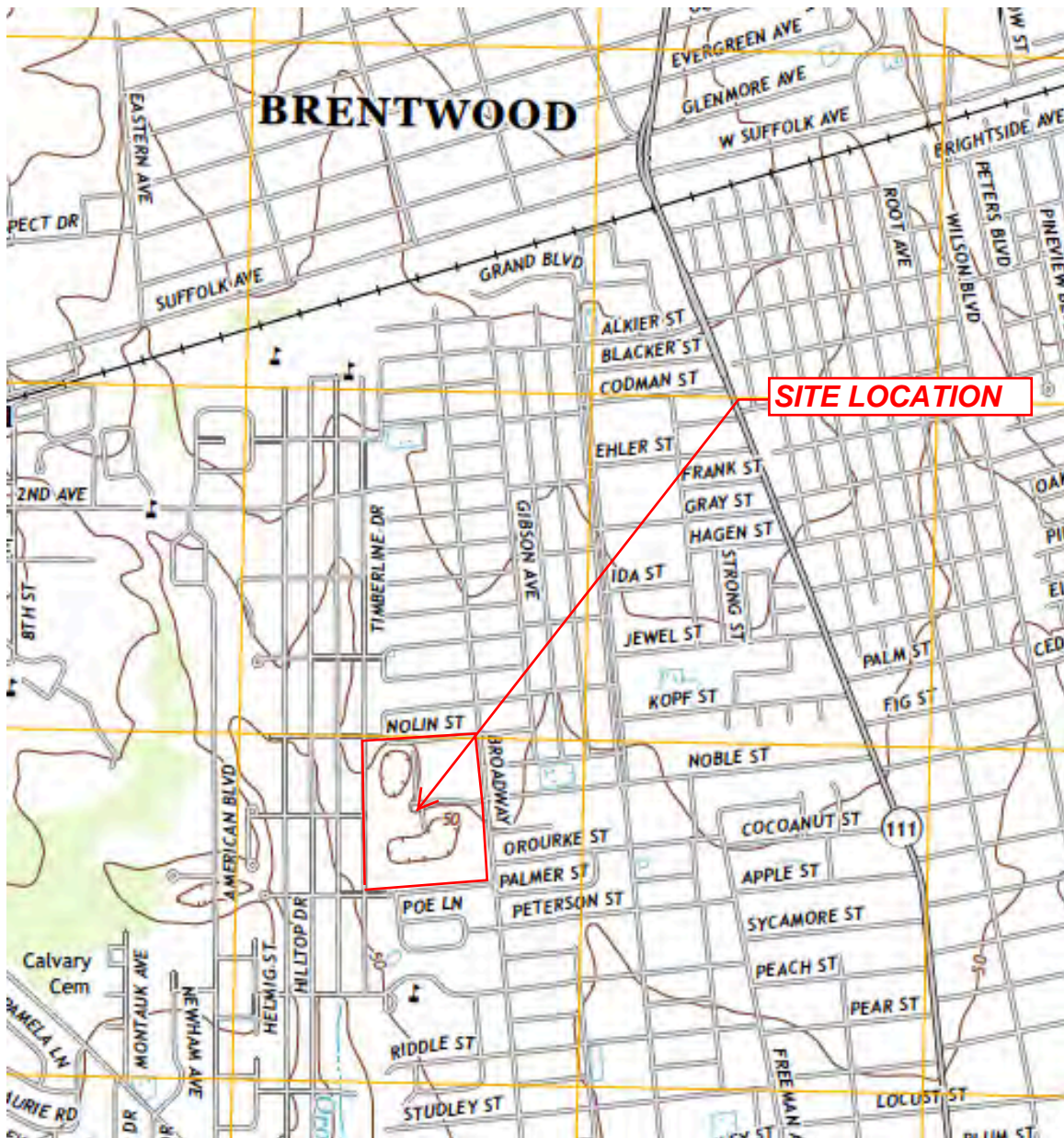
Figure 1 Site Location Roberto Clemente Town Park 400 Broadway, Brentwood, NY