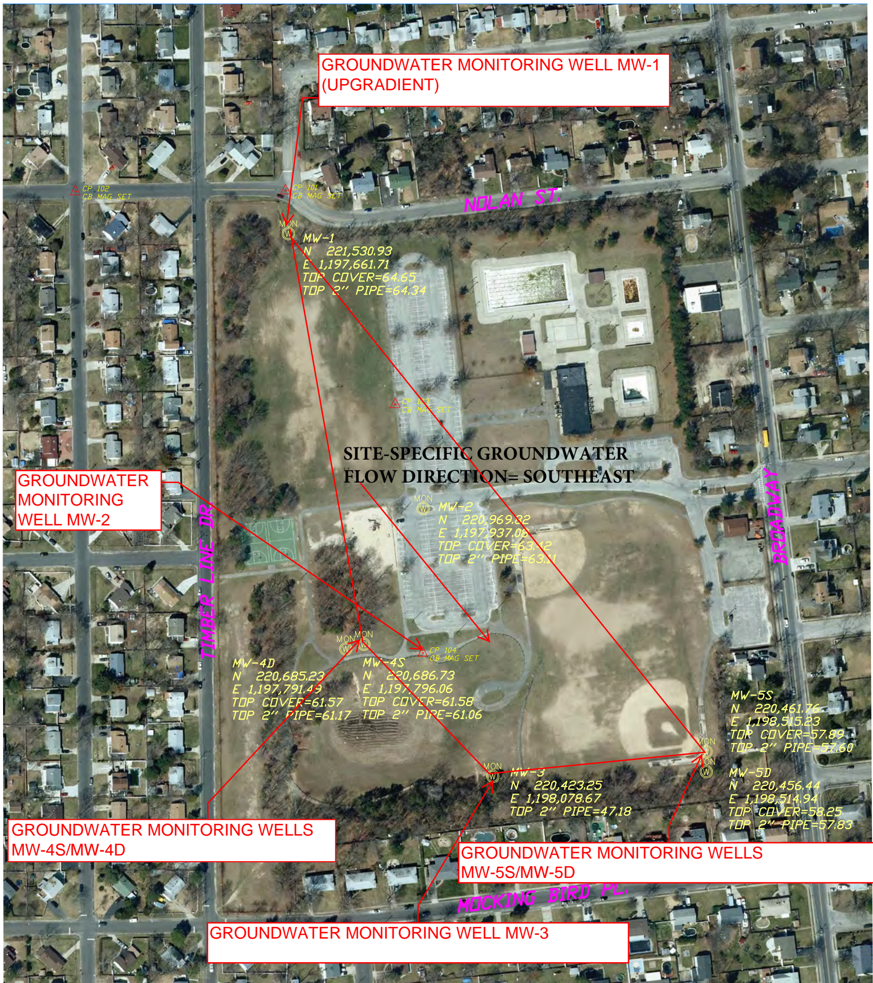
FIGURE 3 GROUNDWATER WELL LOCATIONS ROBERTO CLEMENTE TOWN PARK 400 BROADWAY, BRENTWOOD, NY